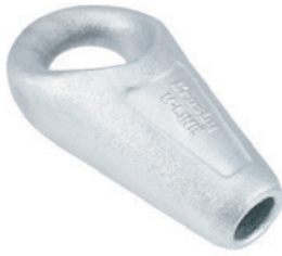
G-517 Mooring Spelter Socket