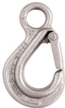
S-315A Eye Chain Hook