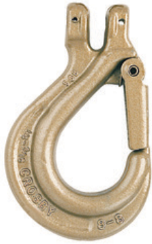
S-314A Clevis Chain Hook