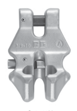
S-1311N Chain Shortener Link