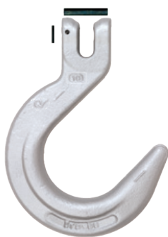
A-1359 Clevis Foundry Hook