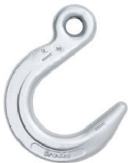
A-1329 Eye Foundry Hook