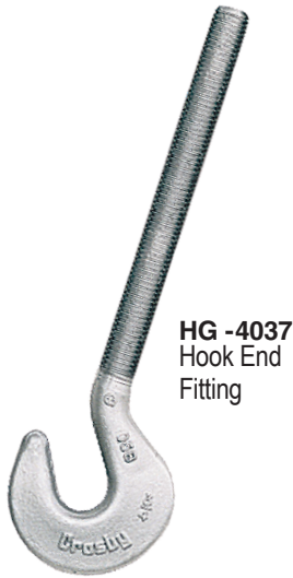
HG -4037 Hook End Fitting