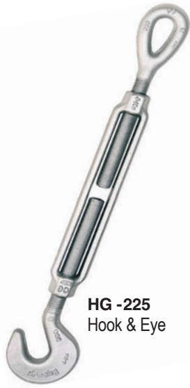
HG -225 Hook & Eye

Meets the performance requirements of Federal Specifications FF-791b, Type 1 Form 1 - CLASS 6, and ASTM F-1145, except for those provisions required of the contractor. For additional information, see page 452.