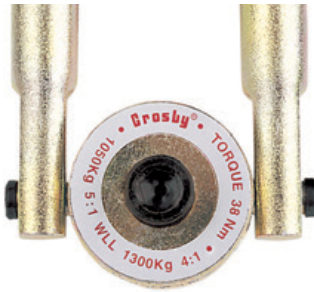
HR-125M Swivel Hoist Ring