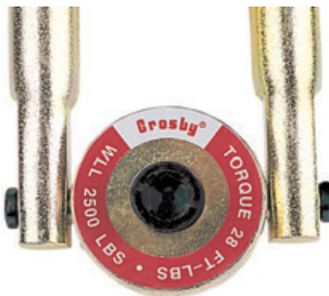
HR-125 Swivel Hoist Ring