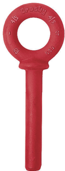
S-276 Shoulder Rivet Eye Bolt