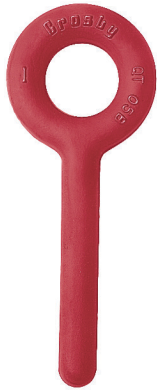
S-293 Rivet Eye Bolt